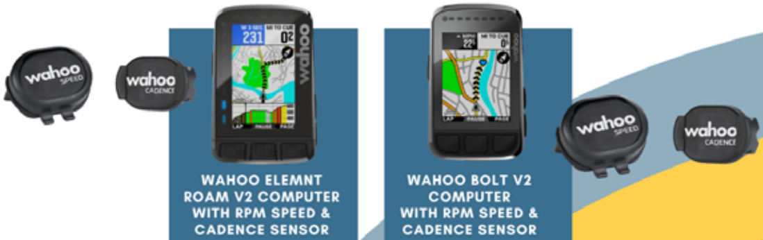
WAHOO ELEMNT ROOM V2 COMPUTER WITH RPM SPEED & CADENCE SENSOR