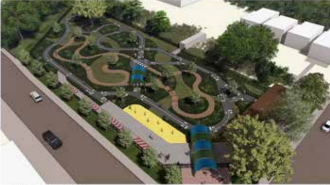
NINE 13 SPORTS | DECEMBER 11, 2025 | IWM