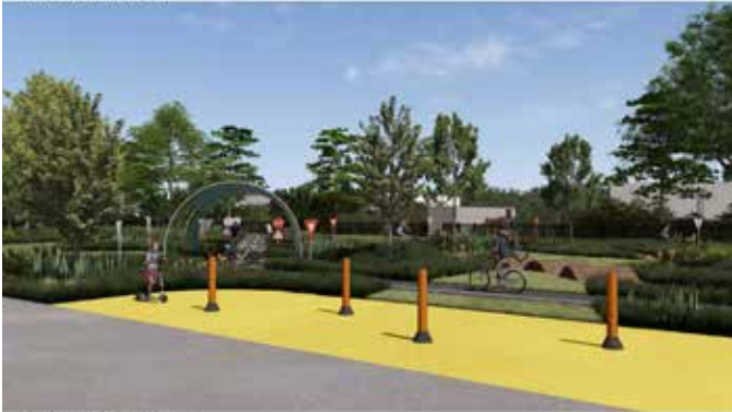
NINE 13 SPORTS | DECEMBER 11, 2025 | IWM