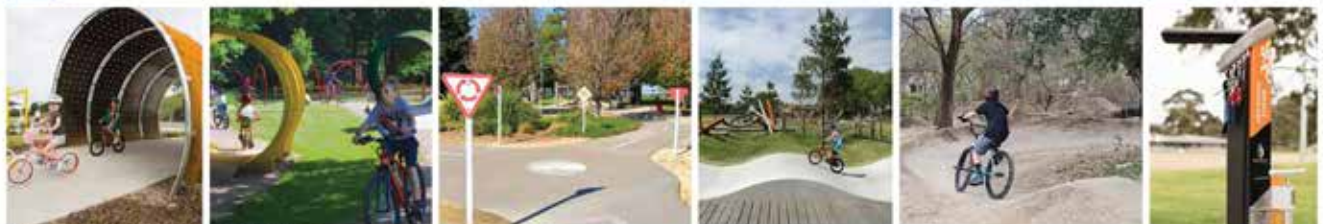
NINE 13 SPORTS | DECEMBER 17, 2025 | IWM