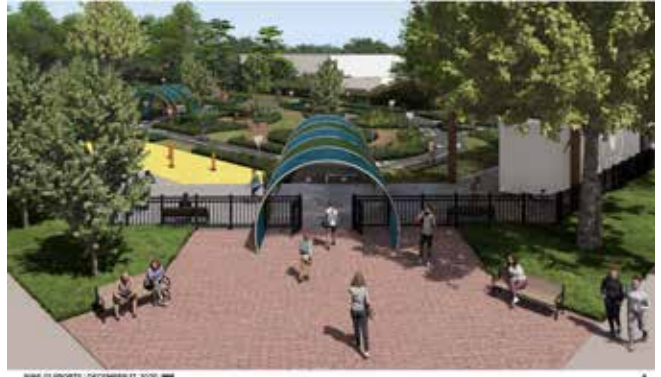
NINE 13 SPORTS | DECEMBER 11, 2025 | IWM