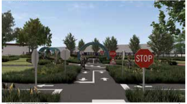
NINE 13 SPORTS | DECEMBER 11, 2025 | IWM